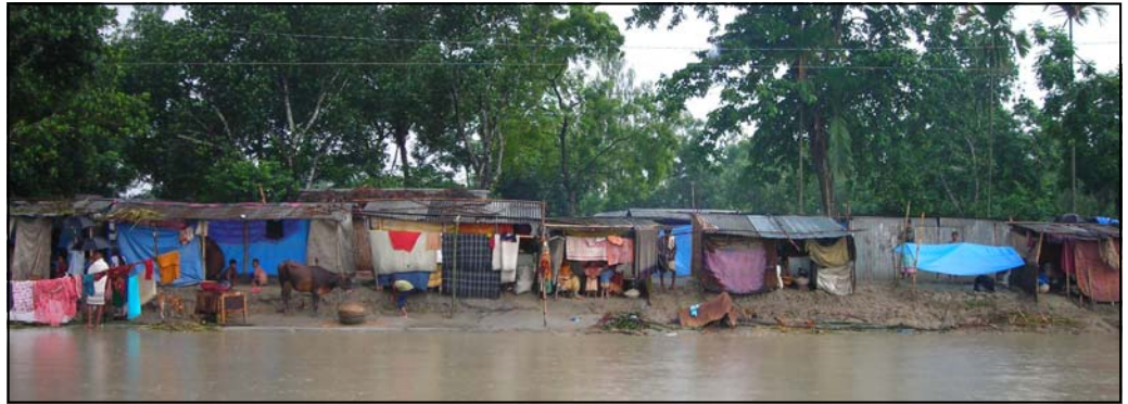
Thousands have fled from the waters and are now camping along the elevated roads.