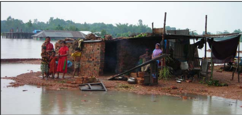
On tiny islands people are waiting for the floods to recede.

For £ 25 (Can$ 55) you can assist one family in their need! The relief package contains food, household utensils and medicine. Long-term rehabilitation costs £ 30 (Can$ 65) per family. We are hoping to assist approximately 12,000 families.