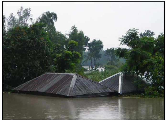
Often the water rises as high as the roof.